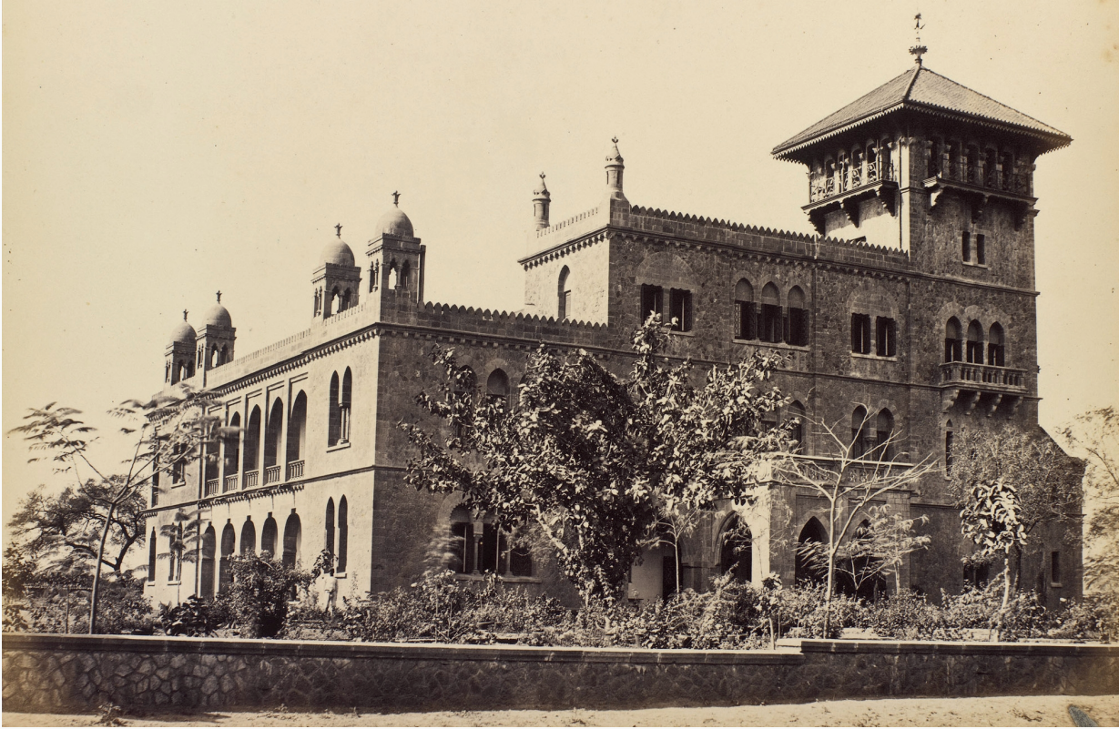
(COEP Tech in year 1865)