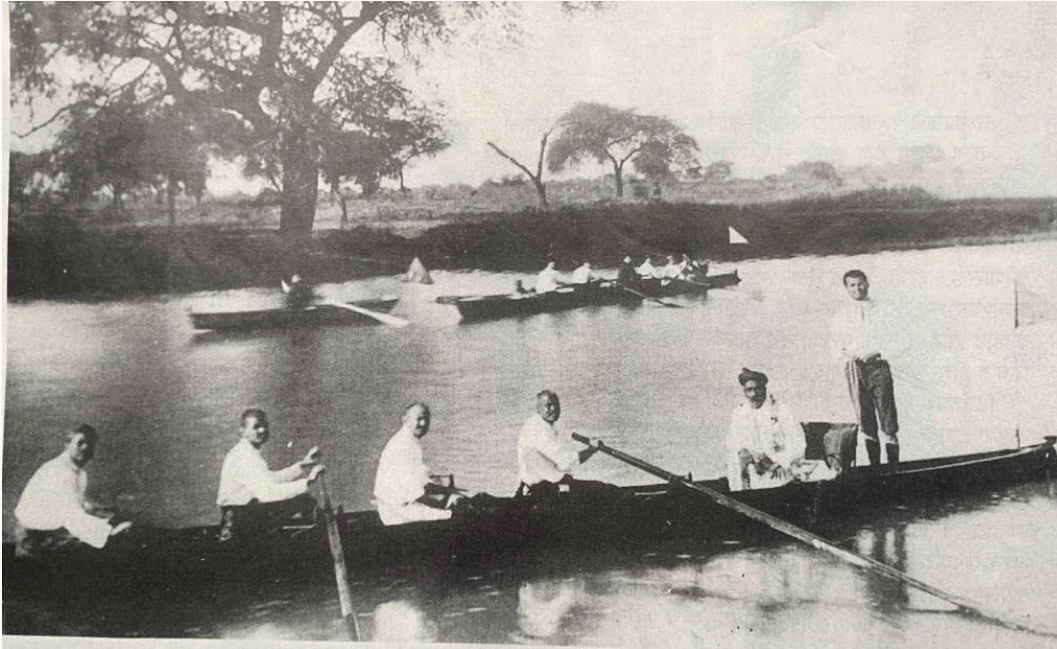
The boat carrying Lokmanya Tilak belongs to The Boat Club of COEP Tech.