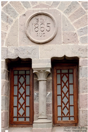
COEP Main Building