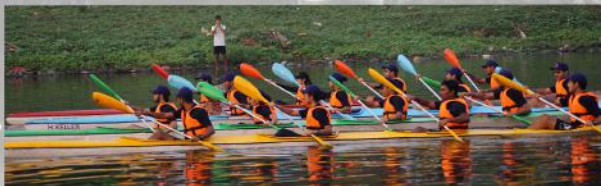
HISTORY CLUB MINI REGATTA